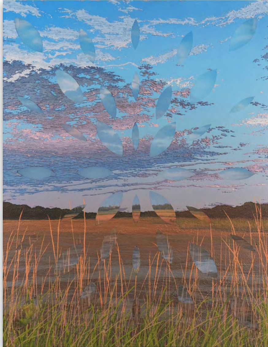
Saskia Fleishman Chincoteague (August 2023 IV) , 2023 acrylic and locally sourced sand on digitally printed chiffon 48h x 36w in 121.92h x 91.44w cm