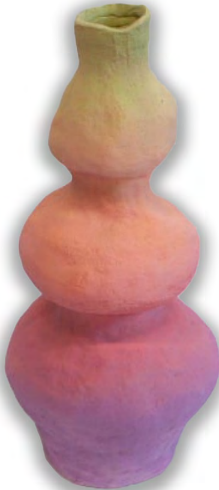
Saskia Fleishman Form 1 (April), 2023 ceramic 16h x 7w x 7d in 40.64h x 17.78w x 17.78d cm $ 1,600.00 In Dallas