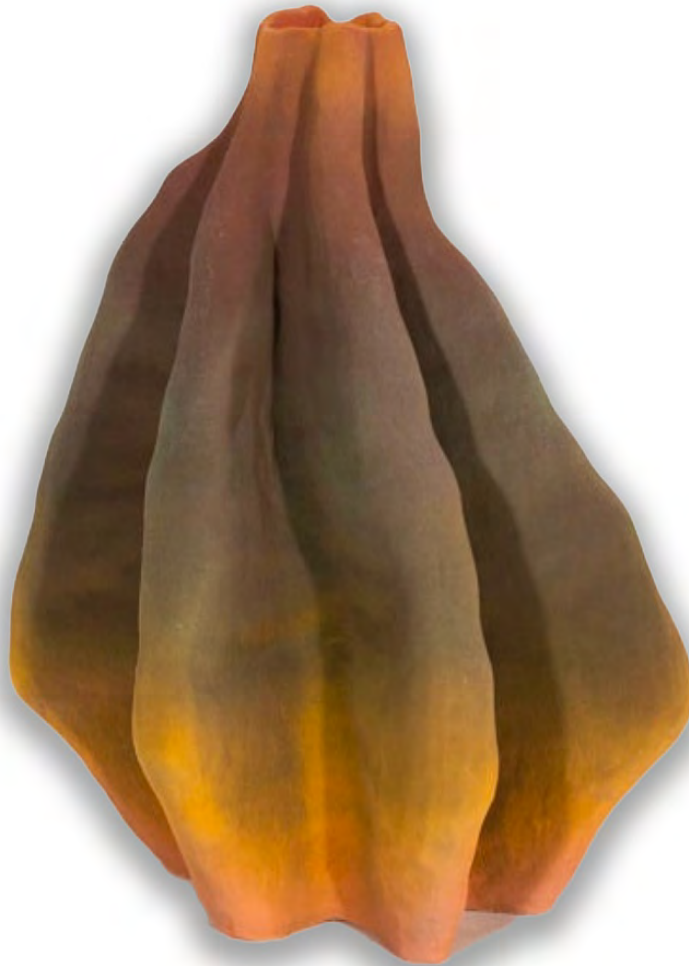
Saskia Fleishman Form 3 (June) , 2023 ceramic 13h x 11w x 11d in 33.02h x 27.94w x 27.94d cm $ 2,000.00 In Dallas