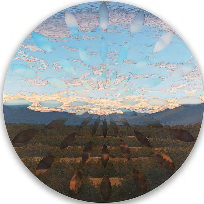
Saskia Fleishman Sedona (December 2019), 2024 acrylic and locally sourced sand on digitally printed chiffon 40h x 40w in 101.60h x 101.60w cm