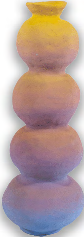
Saskia Fleishman Form 1 (August), 2022 ceramic 13h x 4w x 4d in 33.02h x 10.16w x 10.16d cm In Dallas