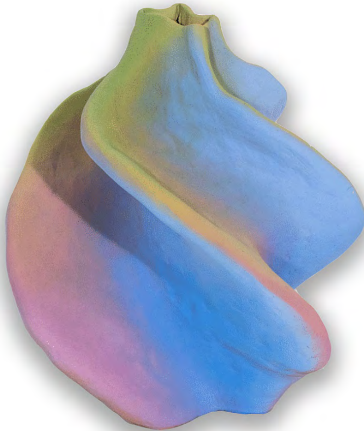
Saskia Fleishman Form 2 (June) , 2023 ceramic 10h x 10w x 9d in 25.40h x 25.40w x 22.86d cm$ 1,800.00 In Dallas