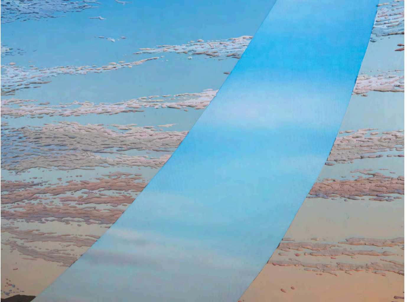
Joshua Tree (January 2024), 47.2 x 70.8"