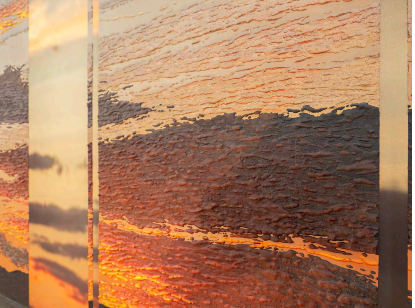
Cape Elizabeth (July 2018), 48 x 60"