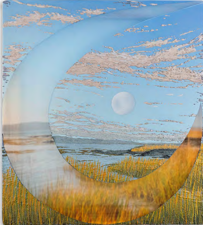
Saskia Fleishman Scarborough (September 2023) , 2023 acrylic and locally sourced sand on digitally printed chiffon 20h x 18w in 50.80h x 45.72w cm