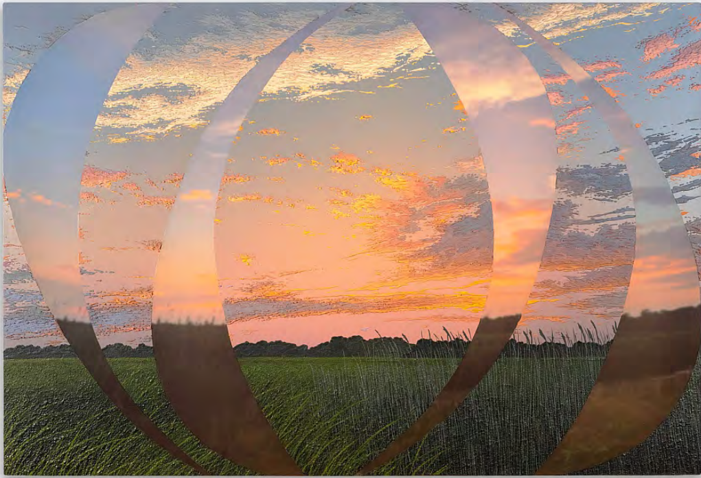
Saskia Fleishman Chincoteague (August 2023) , 2024 acrylic and locally sourced sand on digitally printed chiffon 47.20h x 70.80w in 119.89h x 179.83w cm