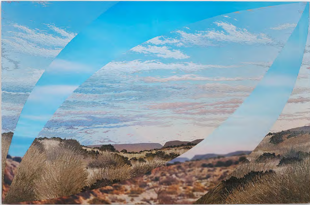
Saskia Fleishman Joshua Tree (January 2024) , 2024 acrylic and locally sourced sand on digitally printed chiffon 47.20h x 70.80w in 119.89h x 179.83w cm