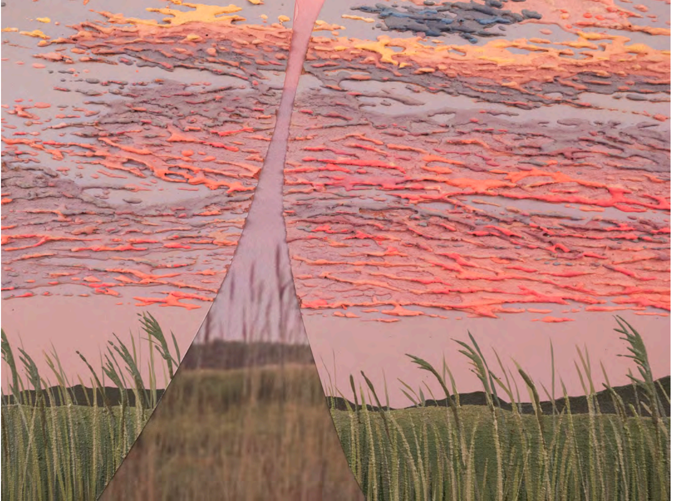
Chincoteague (August 2023 II), 39.3 x 31.5"