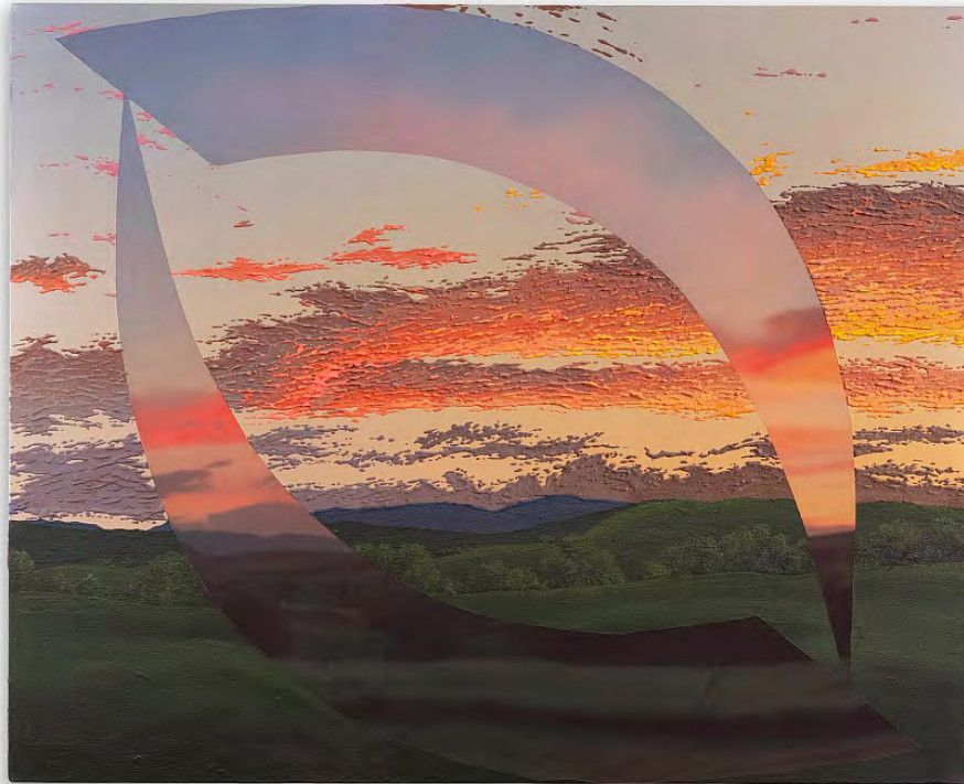
Saskia Fleishman Sheridan (June 2021), 2023 acrylic and locally sourced sand on digitally printed chiffon 31.50h x 39.30w in 80.01h x 99.82w cm