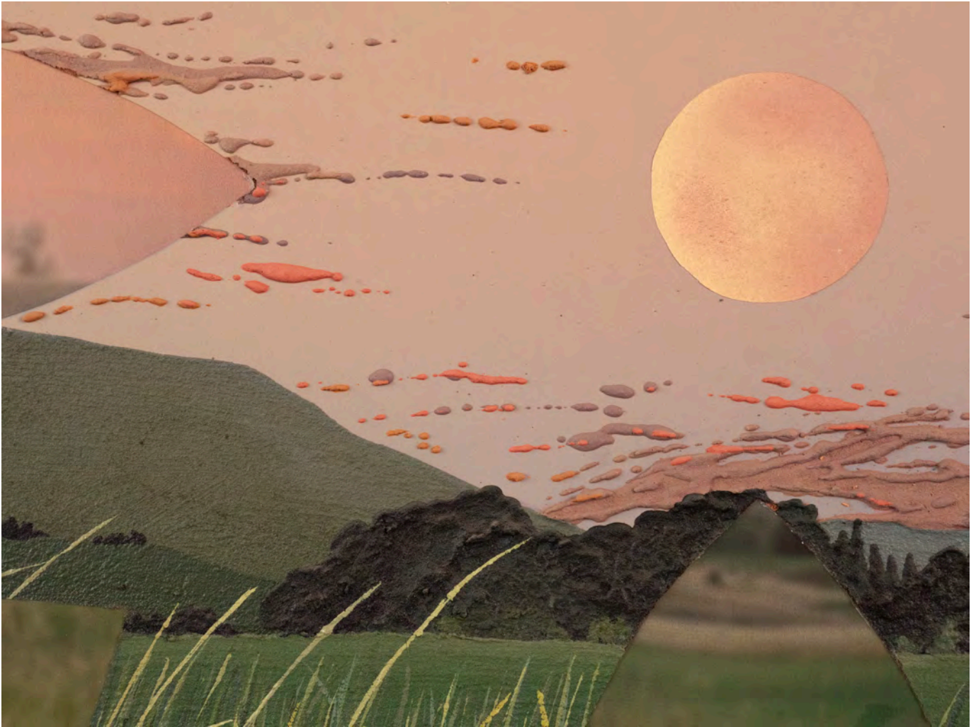
Tongue River Canyon (October 2022), 27.5 x 47.2"