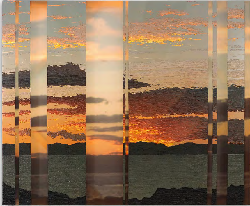
Saskia Fleishman Cape Elizabeth (July 2018) , 2024 acrylic and locally sourced sand on digitally printed chiffon 48h x 60w in 121.92h x 152.40w cm