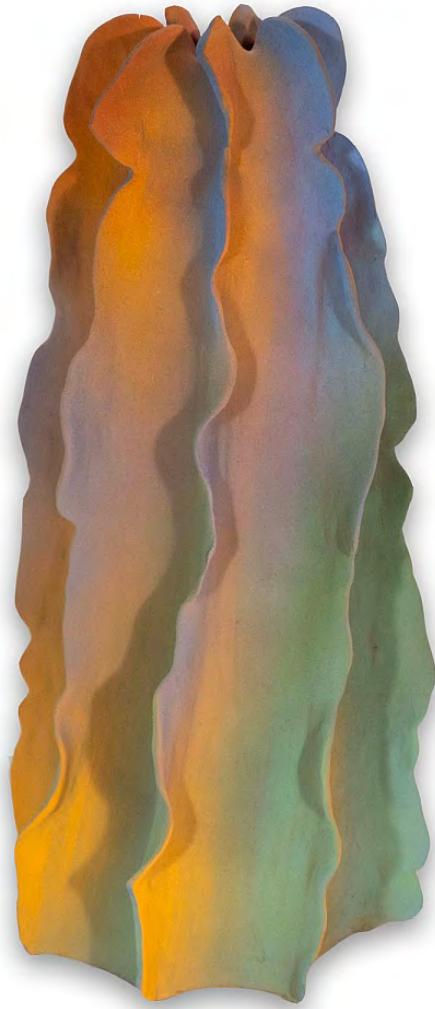
Saskia Fleishman Form 5 (June) , 2023 Ceramic 14h x 6w x 6d in 35.56h x 15.24w x 15.24d cm