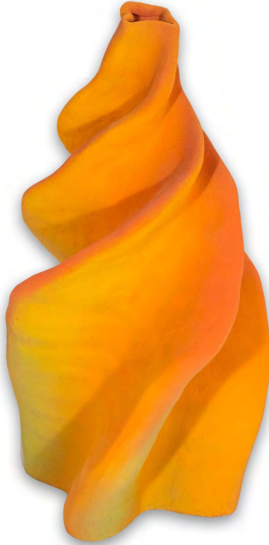
Saskia Fleishman Form 6 (June) , 2023 Ceramic 14h x 8w x 8d in 35.56h x 20.32w x 20.32d cm