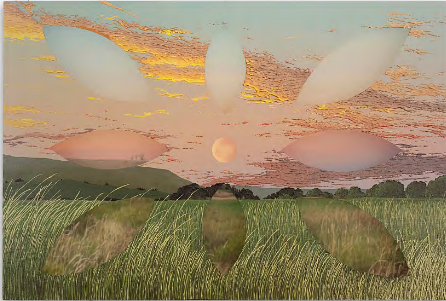
Saskia Fleishman Tongue River Canyon (October 2022), 2023 acrylic and locally sourced sand on digitally printed chiffon 27.50h x 47.20w in 69.85h x 119.89w cm