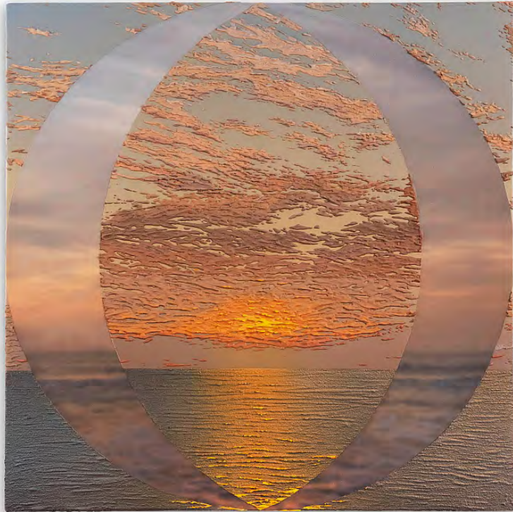
Saskia Fleishman Santa Monica (January 2024) , 2024 acrylic and locally sourced sand on digitally printed chiffon 32h x 32w in 81.28h x 81.28w cm