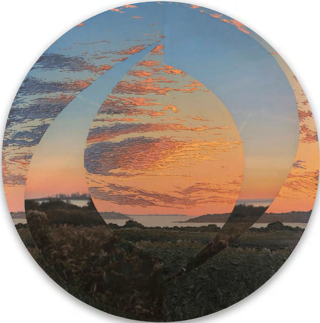
Saskia Fleishman Cape Elizabeth (September 2023) , 2023 acrylic and locally sourced sand on digitally printed chiffon 40h x 40w in 101.60h x 101.60w cm