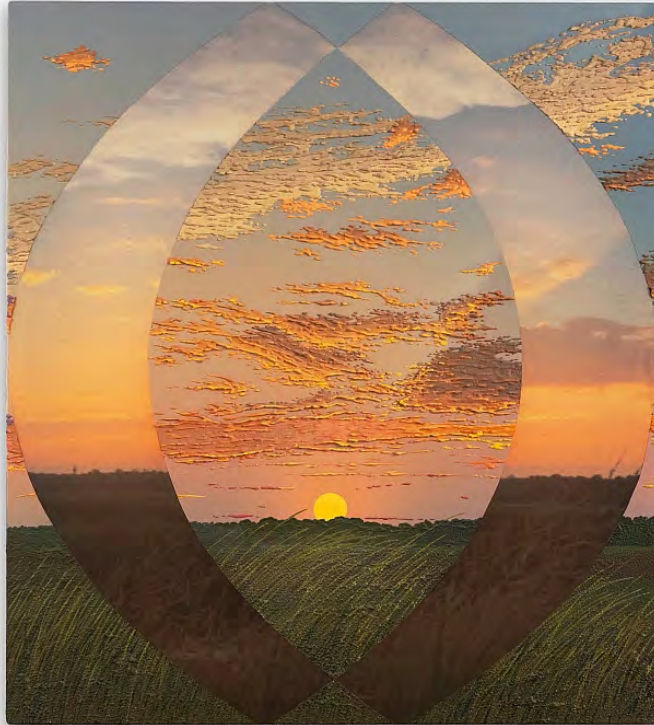
Saskia Fleishman Chincoteague (August 2023 III) , 2023 acrylic and locally sourced sand on digitally printed chiffon 31.50h x 27.50w in 80.01h x 69.85w cm $ 3,000.00