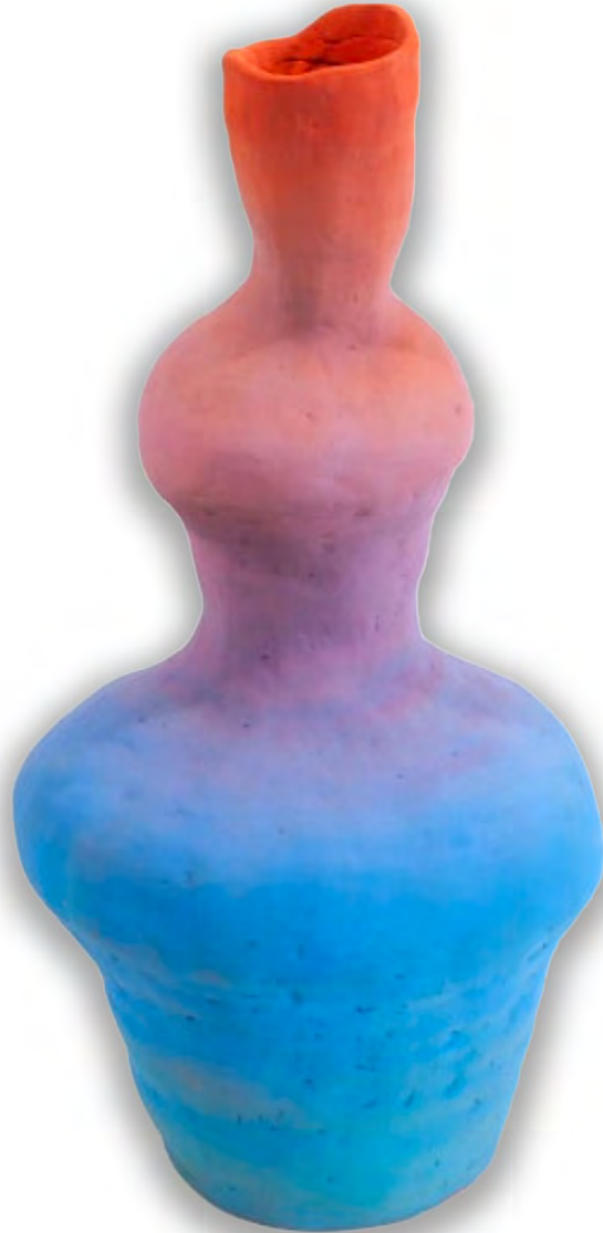
Saskia Fleishman Form 3 (October), 2023 ceramic 13.50h x 8w x 8d in 34.29h x 20.32w x 20.32d cm$ 1,600.00 In Dallas